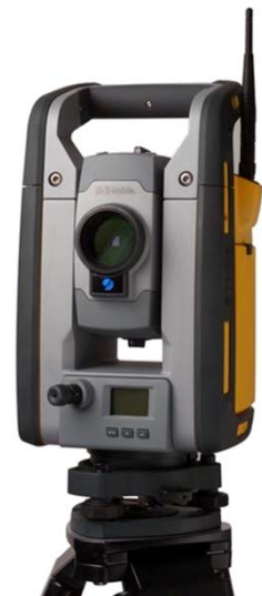
Universal Total Station