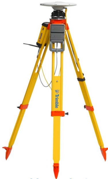
GNSS Base Station

For the GCS900 3D with GNSS OR GNSS and Laser Augmentation