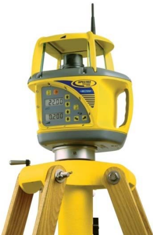
GL700 Grade Laser

For the GCS900 2D AND For the GCS900 3D with Laser Augmentation